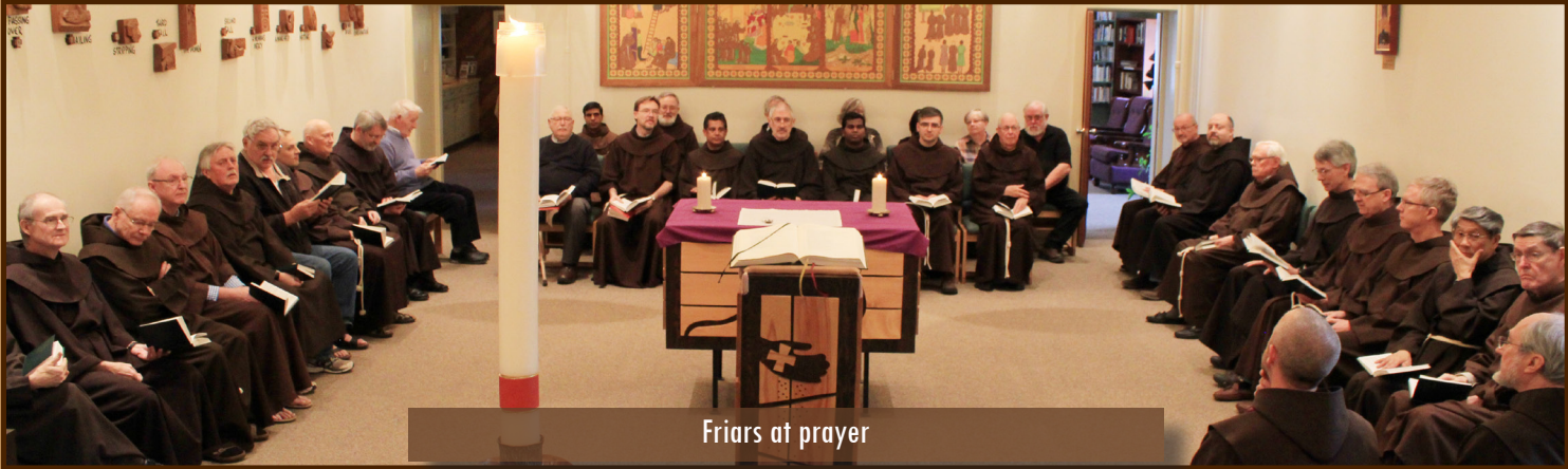
Friars at prayer